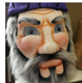
Hurricane costumer is in me (video)