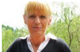
Dreama's island: Gilligan's legacy is alive